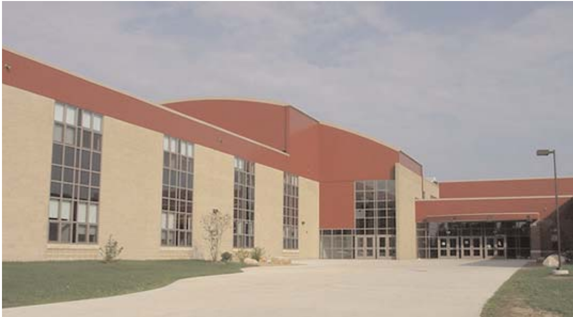
Nashua High School Nashua, New Hampshire