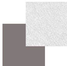
Flat Screen Training Table Paint: Slate Laminate: Chargrey Suede

The new Hawthorn building at Penn State Altoona consists of approximately 58,000 square feet. Of that total, 10,000 square feet of the building was dedicated to a new computer center. The construction plans included three computer classrooms, two of which would be adjoining for lecture and computer labs.